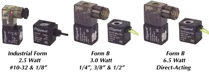
Industrial Form 2.5 Watt #10-32 & 1/8"